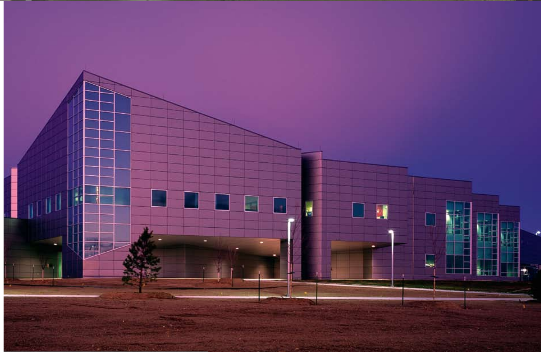
Army Space Command Headquarters Building Peterson Air Force Base, Colorado

We have the flexibility and resources to respond to our Government’s infrastructure needs by providing streamlined processes and integrated solutions to the design and construction of a wide range of facilities.