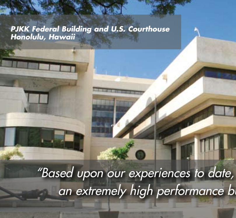
PJKK Federal Building and U.S. Courthouse Honolulu, Hawaii