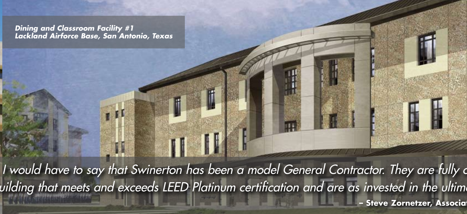
Dining and Classroom Facility #1 Lackland Airforce Base, San Antonio, Texas