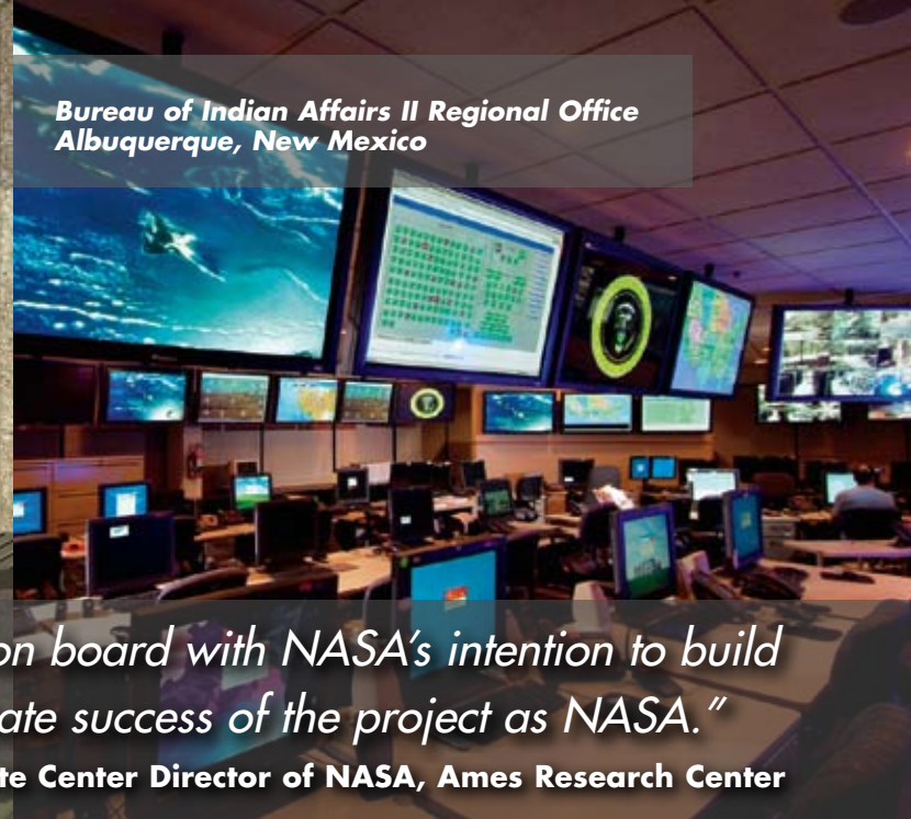
Bureau of Indian Affairs II Regional Office Albuquerque, New Mexico

“Based upon our experiences to date, I would have to say that Swinerton has been a model General Contractor. They are fully on board with NASA’s intention to build an extremely high performance building that meets and exceeds LEED Platinum certification and are as invested in the ultimate success of the project as NASA.”