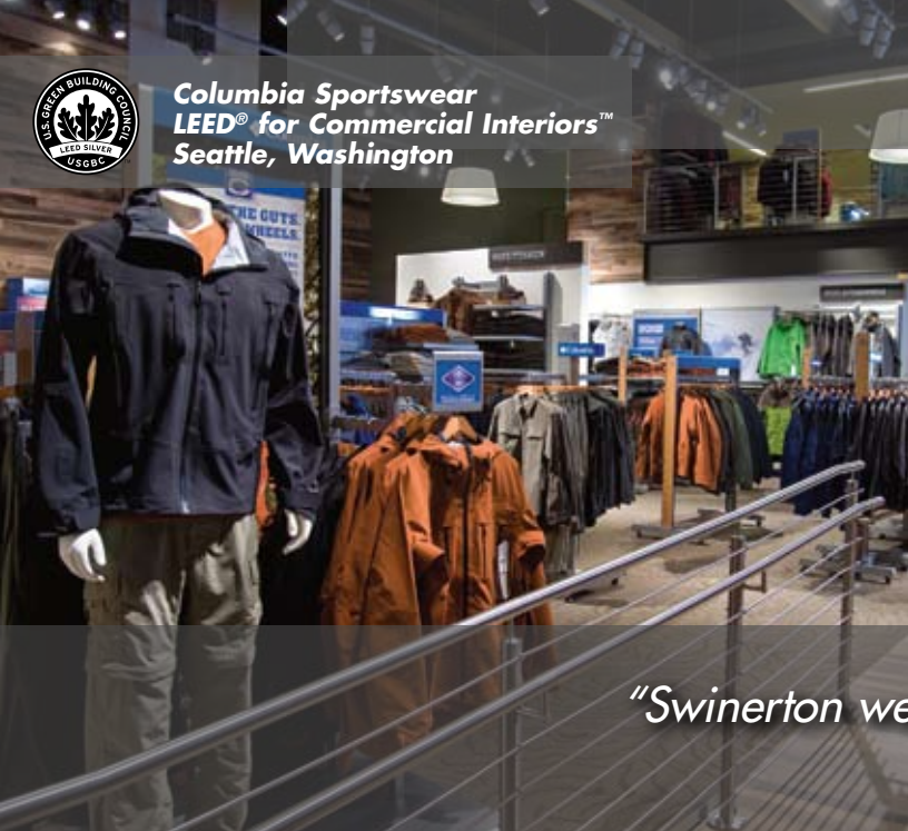
Columbia Sportswear LEED® for Commercial Interiors™ Seattle, Washington