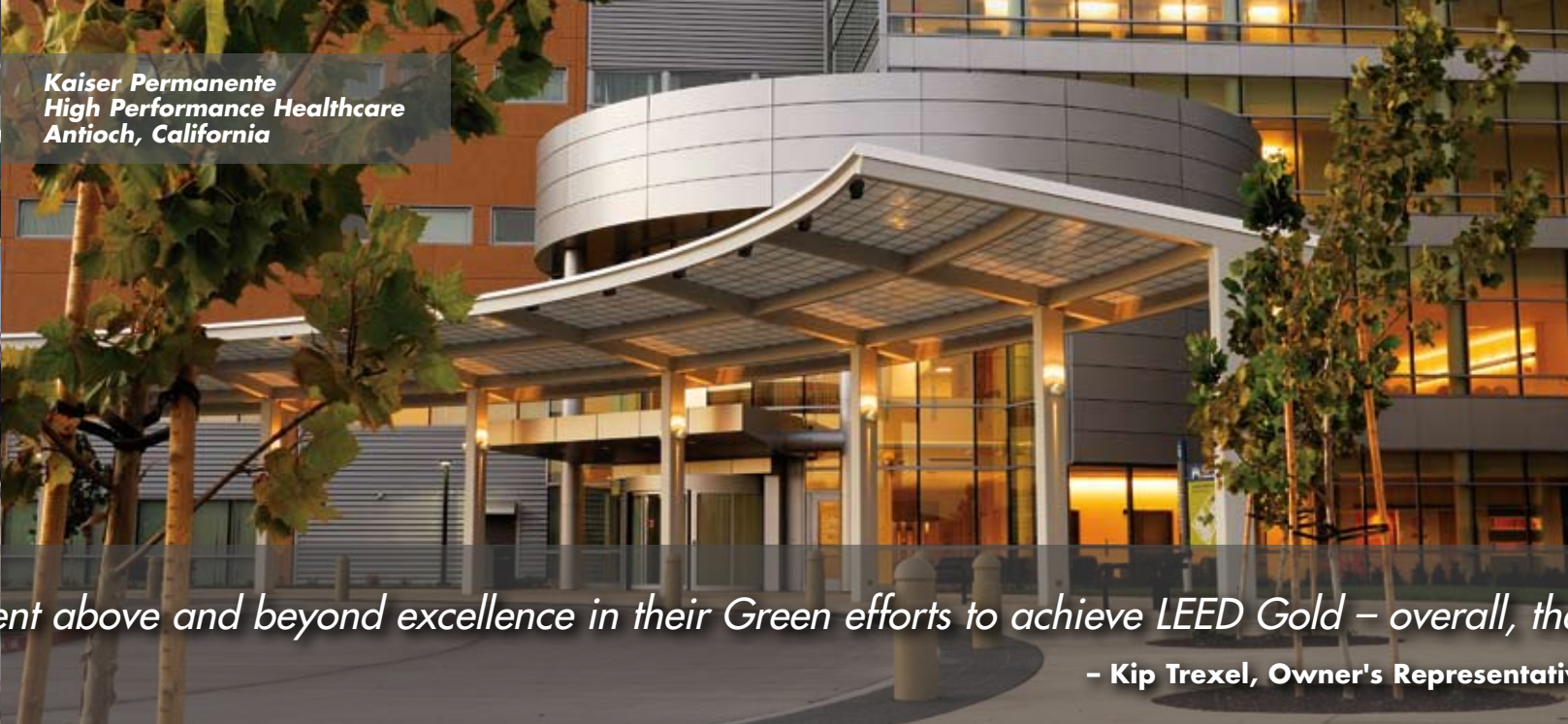
Kaiser Permanente High Performance Healthcare Antioch, California