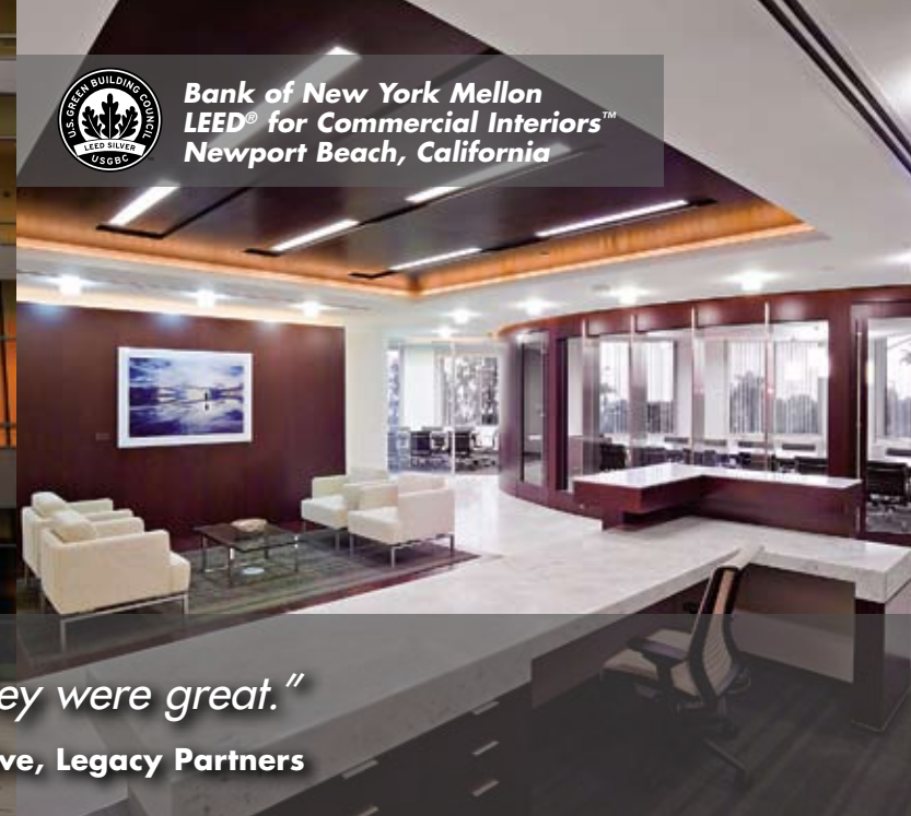
Bank of New York Mellon LEED® for Commercial Interiors™ Newport Beach, California

"Swinerton went above and beyond excellence in their Green efforts to achieve LEED Gold – overall, they were great."