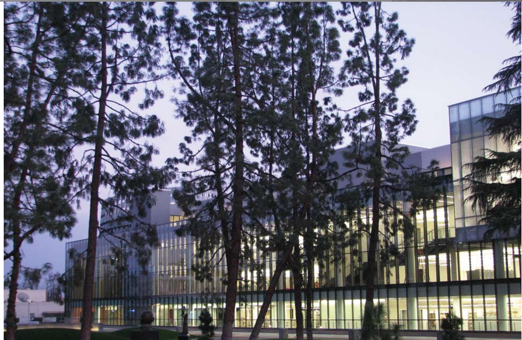
California State University Fresno Henry Madden Library

From ground-up new buildings to utility upgrades and tenant improvements, our scalable approach to building can cover all your construction needs.