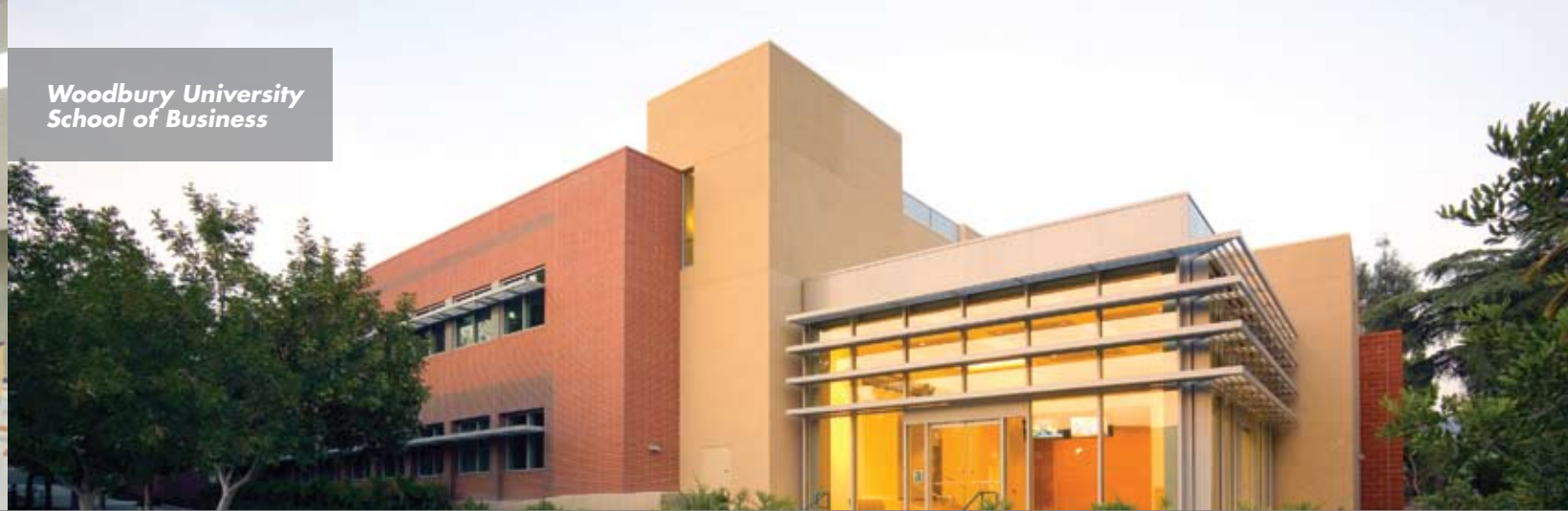
Woodbury University School of Business