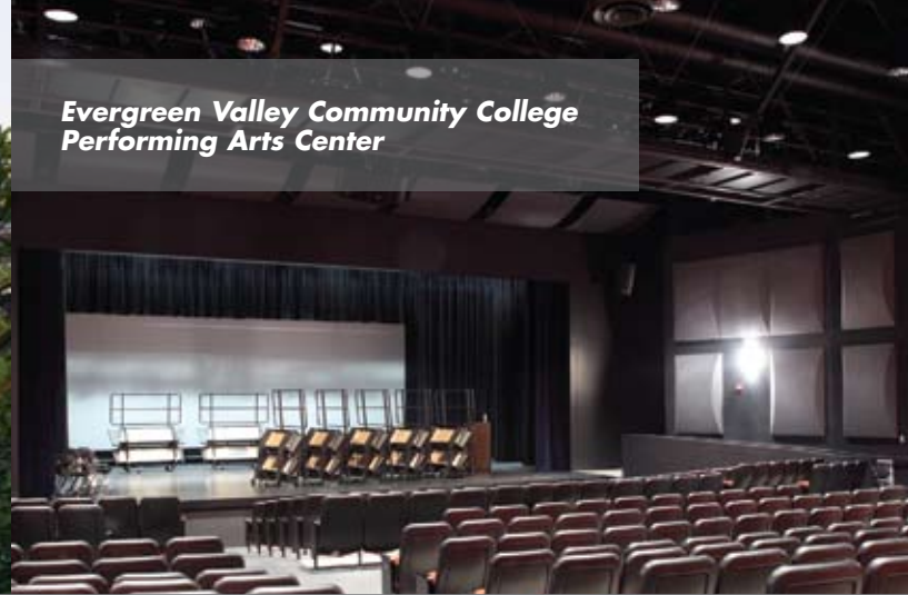
Evergreen Valley Community College Performing Arts Center

"Integrity, quality, great communication throughout the design and construction process, and above all team spirit has defined our experience with Swinerton...whether in design or the startup of a building, as Architects, we desire and look forward to working again with Swinerton."