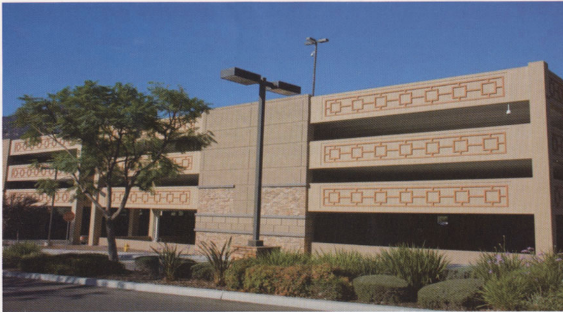
Pala Casino Spa and Resort North Parking Garage Temecula, California